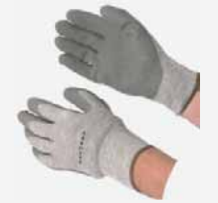
19705 Grey Latex w/Thermal Lining