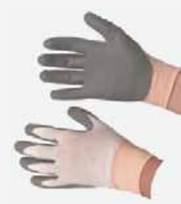
19801 Grey on white