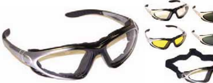
Chameleos II S37S